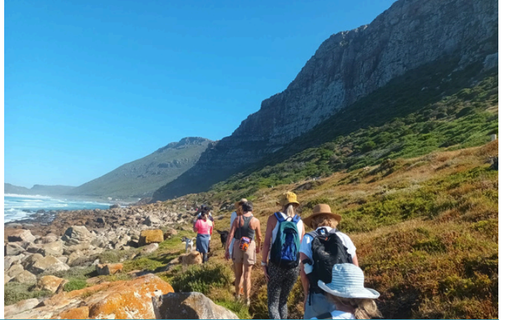
11TH ANNUAL HOME FROM HOME AMBLE