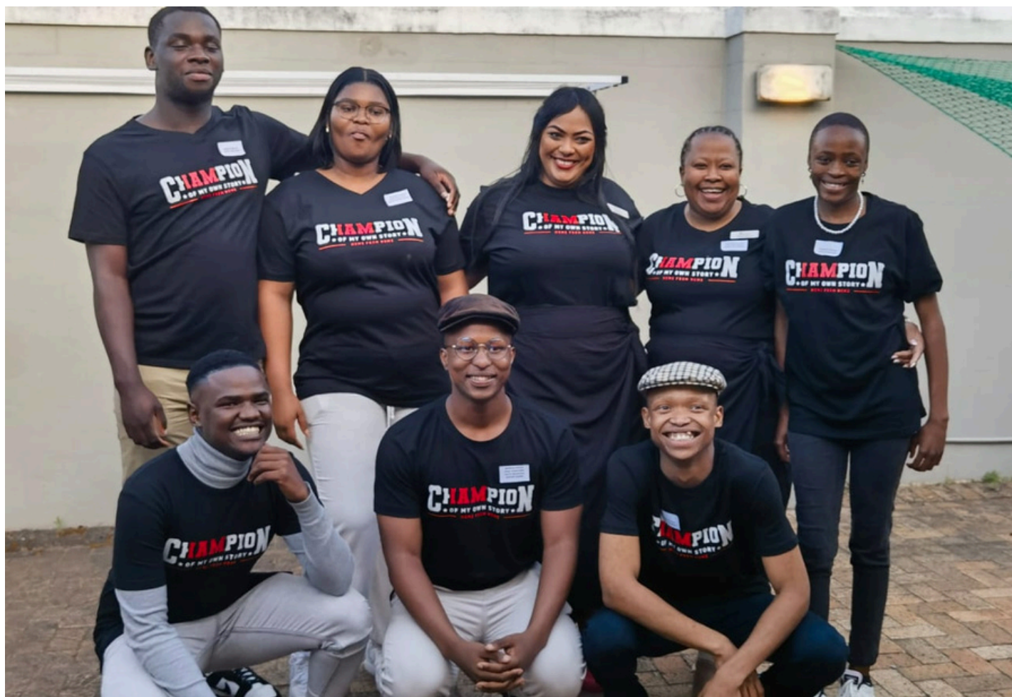
Our Transition Support Programme Team stand proudly with amazing young people who are Champion's of their story.

This is particularly pleasing to us at Home from Home, especially considering the very disadvantaged situations our children began with. While the core of our work in establishing loving family environments is an essential foundation, we do believe that the development of our Educational support programme and Transitional Support Programme have been critical to some of these outcomes.