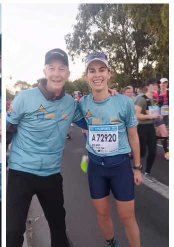
CAPE TOWN CYCLE TOUR AND TWO OCEANS MARATHON