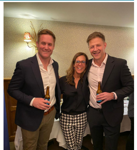
ROYAL PARKS HALF MARATHON FOLLOWED BY A FUNDRAISING AUCTION